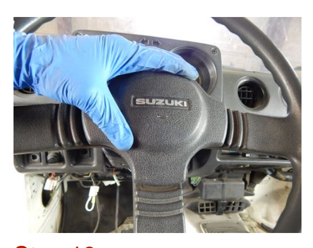
Step 18 Replace the horn button and snap it into place.