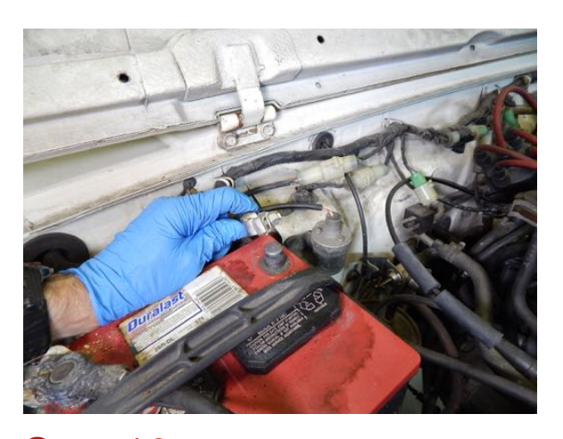
Step 19 Reconnect the negative battery cable.