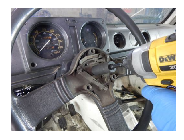
Step 17 Snug the nut using an impact drill. Then torque the nut to 18.5 to 28.5 Ft. Lbs.