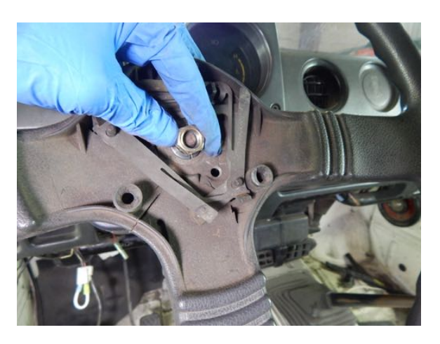
Step 16 Install the nut.