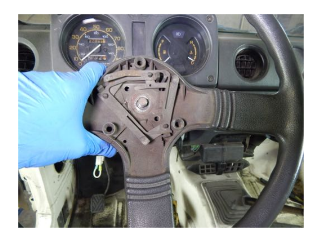
Step 14 Install the steering wheel. Be sure it is level and in the straight ahead position.