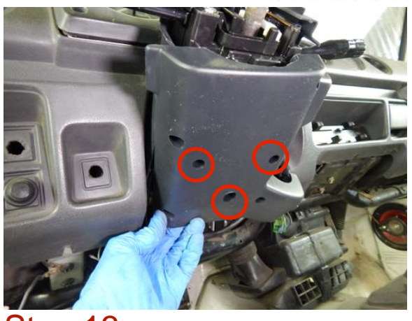
Step 13 Install the supplied lower steering column cover. Be sure the machine threaded screws go in these three holes.