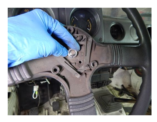
Step 15 Install the lock washer.