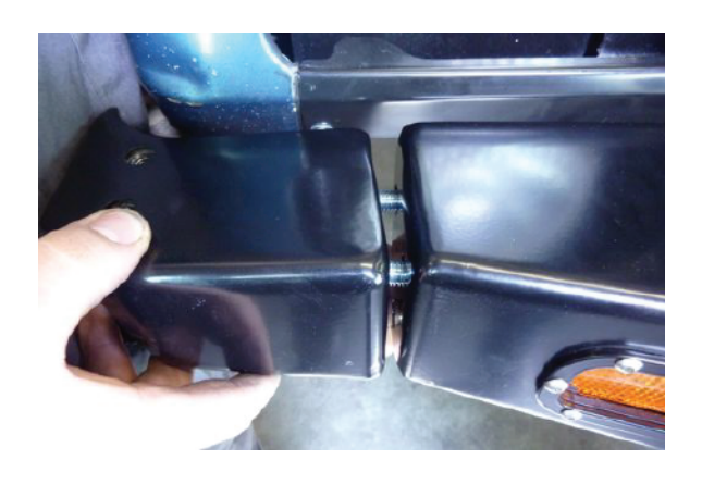
Step 36 Repeat steps 33 through 35 on the passenger side.