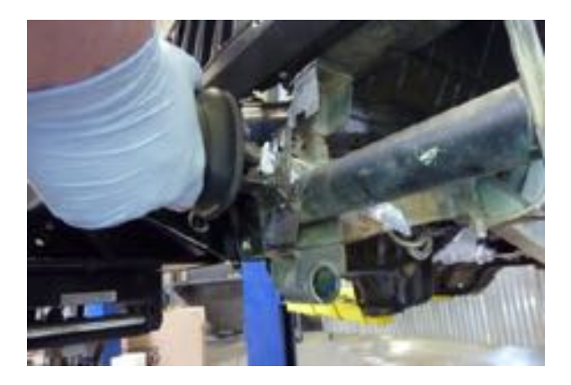
Step 20 Using a Sawzall<sup>®</sup> or hacksaw, cut the mount along the mark.