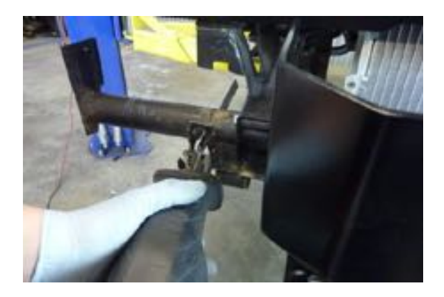
Step 22 Repeat Steps 19 through 21 on the passenger side.

Step 21 Grind the mount with an angle grinder (or file) to eliminate any unsafe edges.