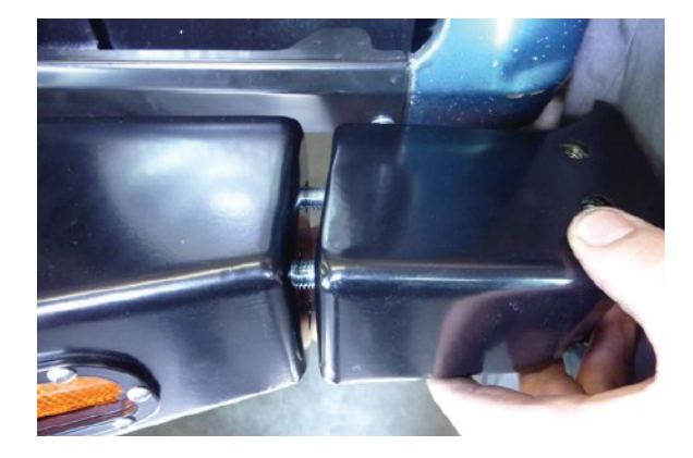
Step 34 Install the (2) supplied (M12X1.75X25) flange bolts.

Position the driver side stubby end as shown.