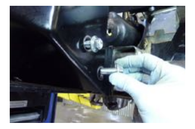
Step 28 Remove the (2) driver side cover bolts.