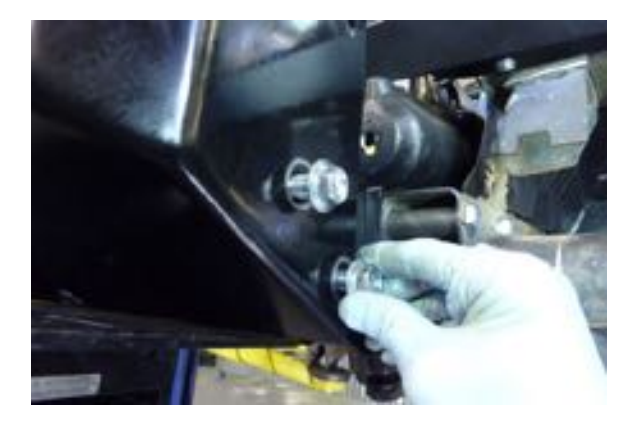
Step 15 Beginning on the driver side, install the (2) supplied (M10X1.75X35mm) flange bolts as shown.