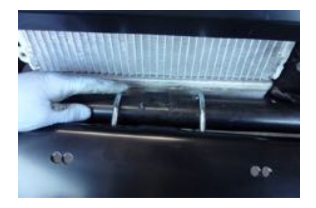
Step 2 Position the winch plate as shown.