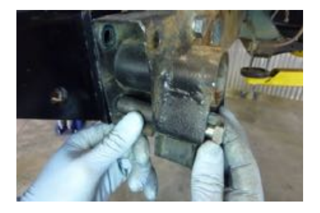
Step 7 Install the bottom (M10X1.25X90) bolt.

Note: These sleeves are carefully sized. If they do not fit inside the frame, we recommend bending the frame rather than reducing the length of the sleeve. This will result a tighter, stronger fit.