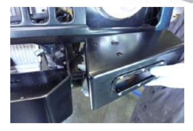
Step 29 Position the driver side short end.