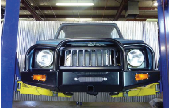
Step 40 Position the grill guard as shown.

This sections applies to the Grill Guard W/Headlight Bars Only