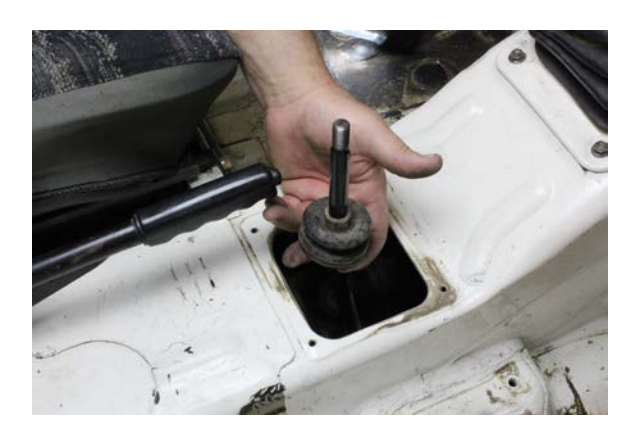
Step 15 Reinstall the lower boot.

Note: Final positioning of the boot may be easier from under the vehicle.