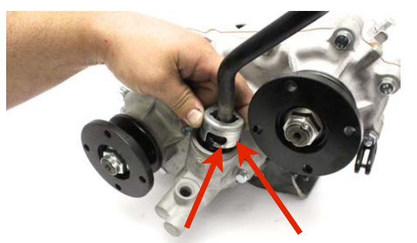
Common Wear Point