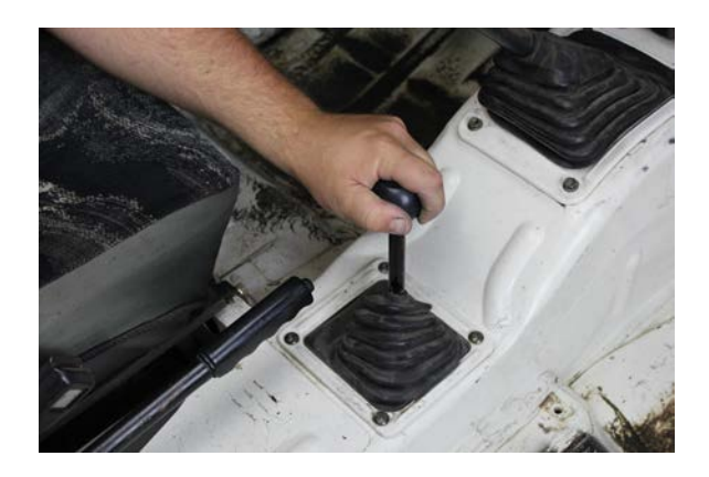
Step 17 Reinstall the shift knob.

Note: If the boot is damaged or cracked we recommend replacing it. New ones can be found on our web site.