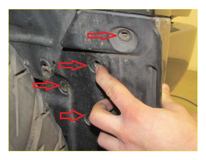
STEP 2 CONTINUED