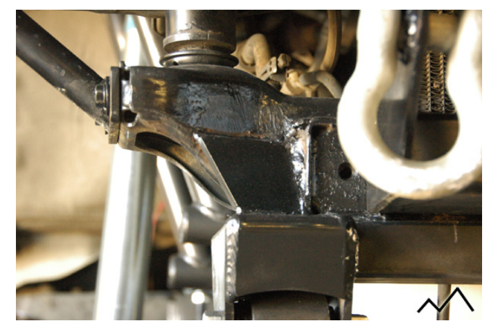
Front Hanger Gussets

After installation of the u-bolts, cut off excess bolt threads so that the u-bolt is flush with the nut.