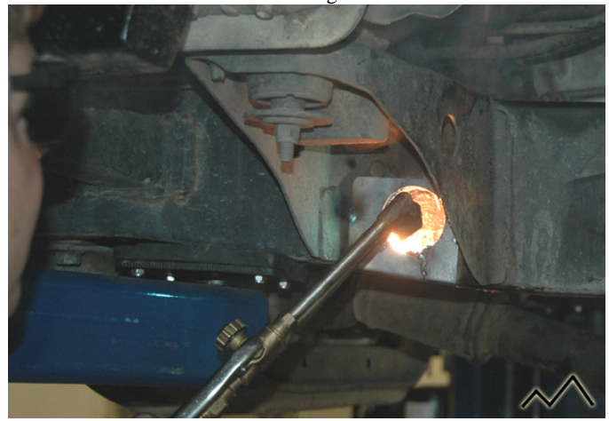
Frame Tube Hole Cutting