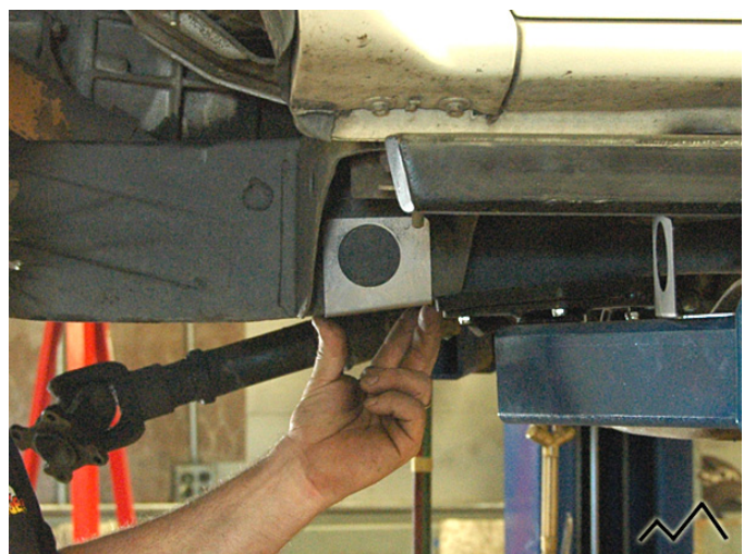
Frame Tube Jig Placement