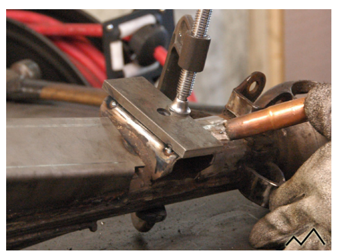
Driver Side Front Spring Pad

After welding on the gusset, armor and spring pad, paint the housing as desired. Once dry, the 3rd member, axles and knuckles can be reassembled. During reassembly, discard the stock steering arms and install the included high steer arms. The steering arm with two rod end holes is installed on the passenger side (right).