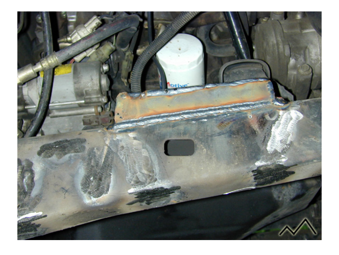
Motor Mount Plate

Install the bumpstop extensions on the frame. Note the axle moves back as it travels up. The bumpstops should contact as close as possible to the center of the extension. We recommend that you tack weld the extension in place first, then using a large rock, ramp or forklift, verify that the bumpstop and extension contact correctly. The gap between the bump stop and the extension should be 3"-4". It may be necessary to shorten the bumpstop when using 3" springs. Actual bumpstop extension length depends on a number of factors including, truck weight, accessories such and aftermarket front bumper/winch, position of the front hanger and position of the frame tubes.