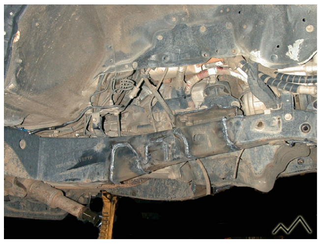
IFS Suspension Removed

When using a torch to remove the IFS brackets, it is possible to nick the frame with the torch. If this has happened, fill the nicks by welding them up and grind flush with the frame. Use a relatively high setting on your welder when filling nicks.