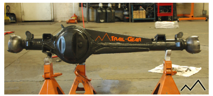
Front Gusset and Armor Installed