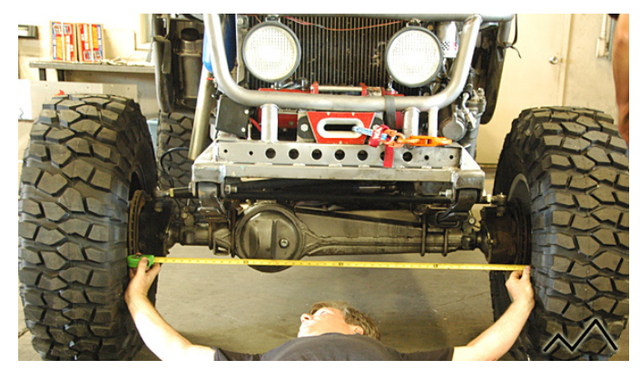
Stetting Tie Rod Adjustments

Tighten the pitman nut to 130 ft/lbs. Tighten the jam nuts on the Tie Rod and Drag Link using an adjustable wrench.