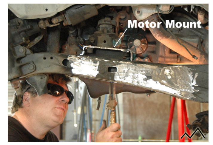
IFS Brackets Ground Off